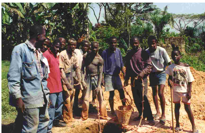
Copyright © 2004 West African Children Support Network